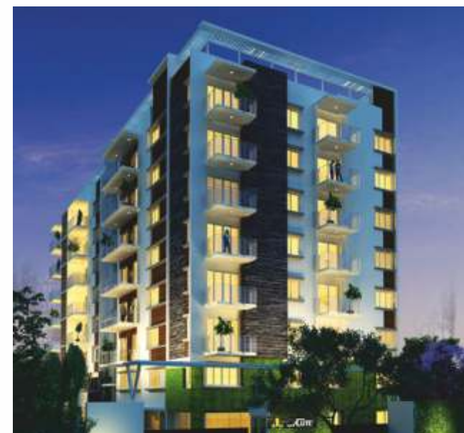
Durga Flute, Bangalore