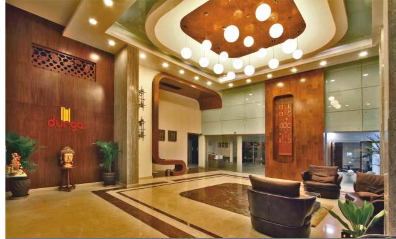
Durga Rainbow, Bangalore