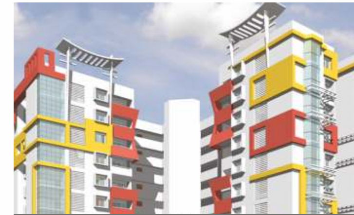
Durga Marine Drive, Patna