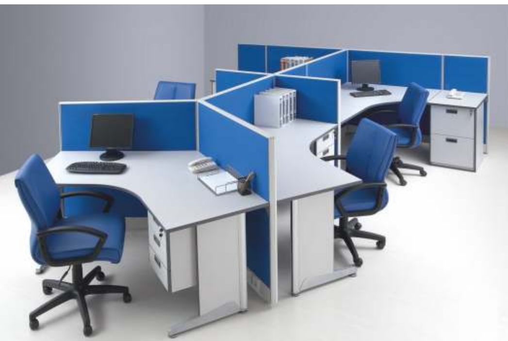
Work from home cubicles