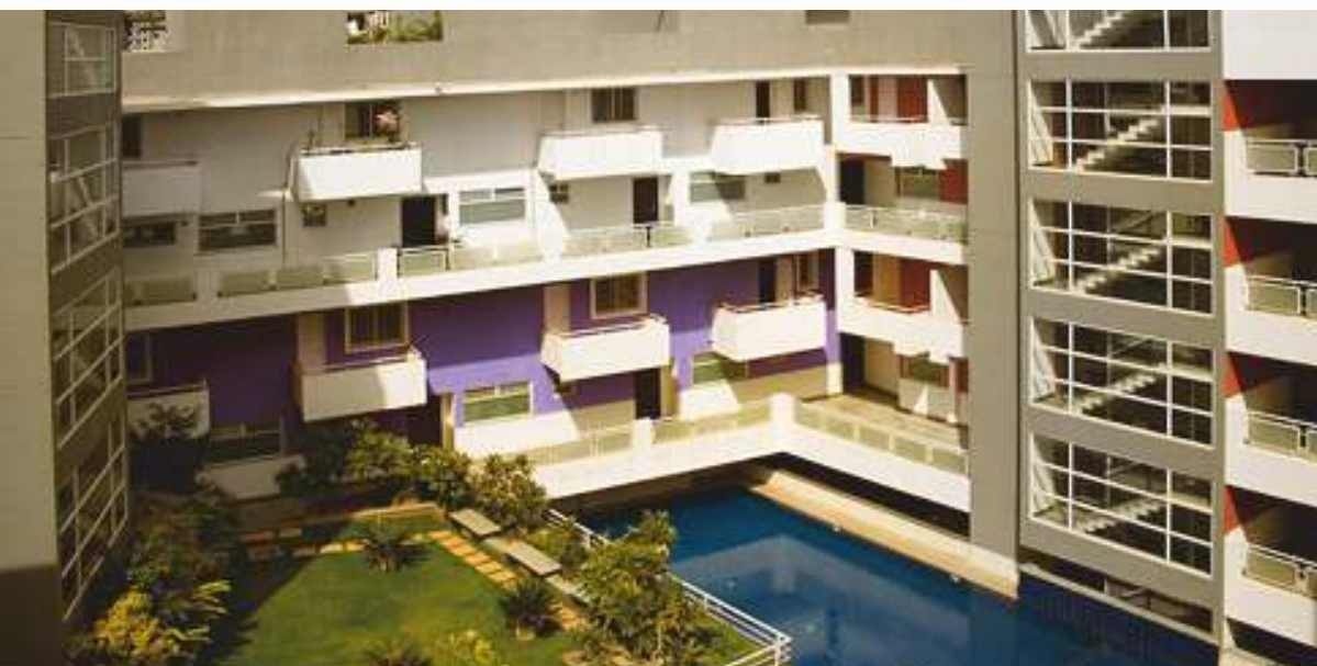
Durga Saffron Square, Bangalore

As always, Durga brings you the latest in construction technology to maximise cost and time. We have incorporated the new aluminium shuttering technology which significantly improves the overall quality of construction. Aluminium Formwork panels are typically designed to be used in components in a building which include floors, walls, balconies, staircases and window projections, and since these are of concrete there is no structural need for block works or brick works.